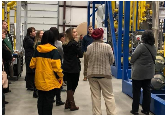
More than 40 people attended the M. Davis & Sons, Inc. tour and networking happy hour during WIC Week.