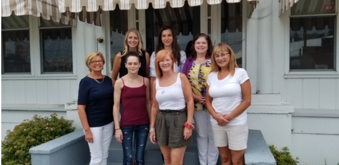
NAWIC members, family, & friends gathered for a networking BBQ at Gemini Janitorial Services in Wilmington, DE to celebrate summer. Thank you to everyone who attended!